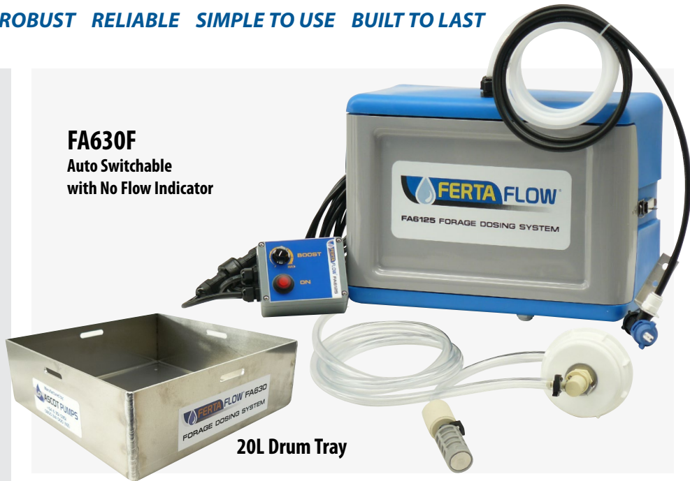
20L Drum Tray