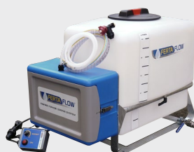
FA6125T (100L tank)