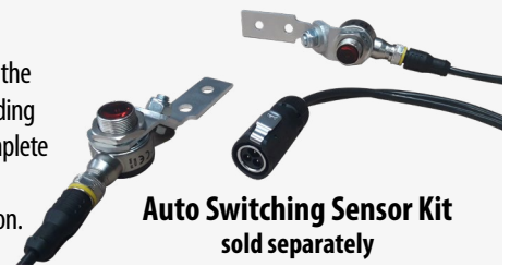
Auto Switching Sensor Kit sold separately

Auto switching sensor kit to detect forage as it enters the baler. Turns the pump on and off as the pick-up is loading and clearing the crop. Built in off-delay to ensure complete coverage. Supplied with mounting brackets for easy installation and prewired for plug-and-play connection.